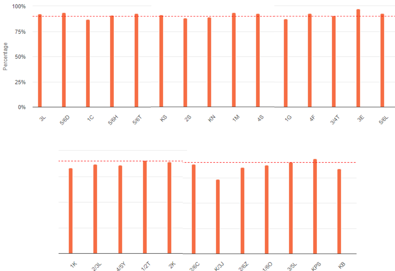
Attendance summary by roll class (2024 All terms)

Please find the below a graph of the school classes which shows percentages for Term 1 attendance. Great job 3E your attendance is amazing.